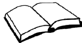
Book = 4 dimes