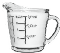
b) Measuring cup