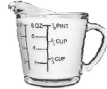
d) Measuring cup

2) Which of the items below could you measure with a measuring cup?